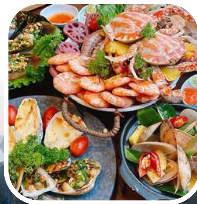
Seafood buffet dinner